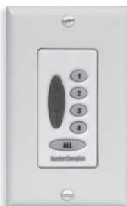
TARGET WIRELESS WALL SWITCH